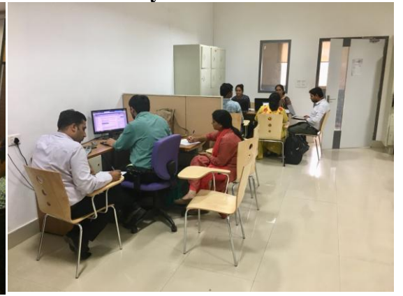
Hands-on session in groups