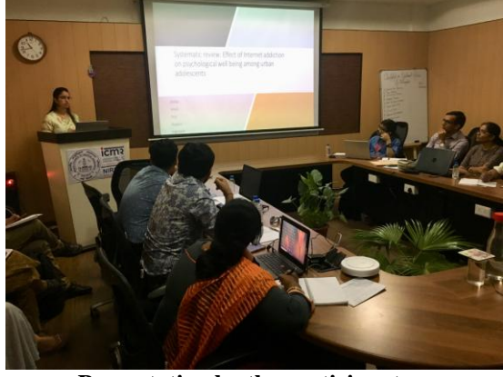
Presentation by the participants