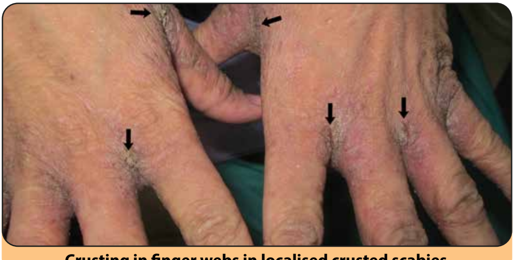
Crusting in finger webs in localised crusted scabies