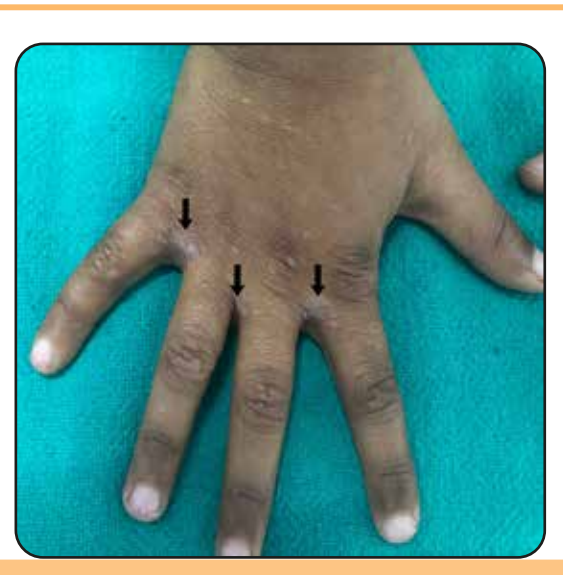
Excoriated papules at the typical sites – breasts, abdomen, web spaces of fingers and wrists