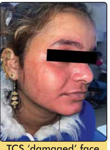
TCS 'damaged' face